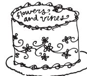
old fashioned flowers & vines