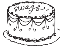
old fashioned swags